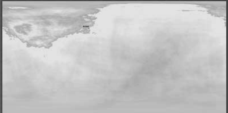
[TOPOGRAPHICAL MAP OF NEW ROMA]