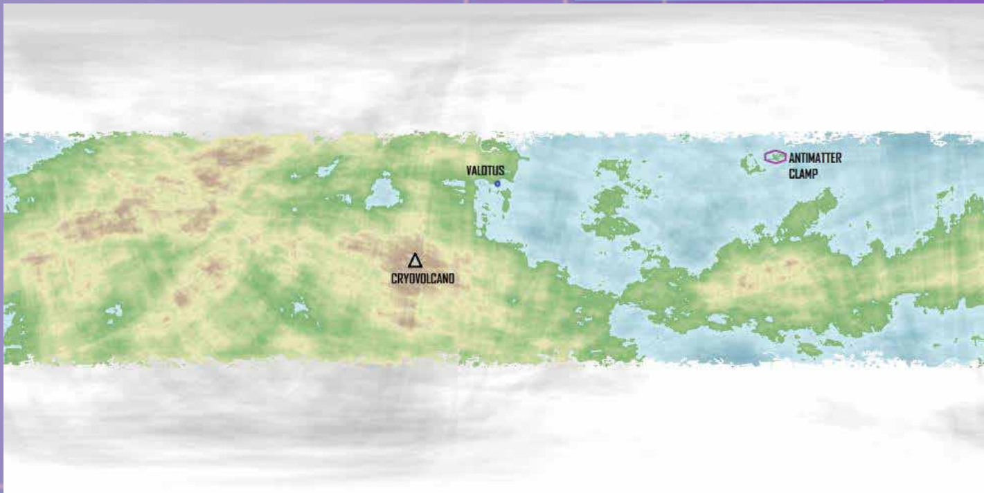
TOPOGRAPHICAL MAP KALUUNI