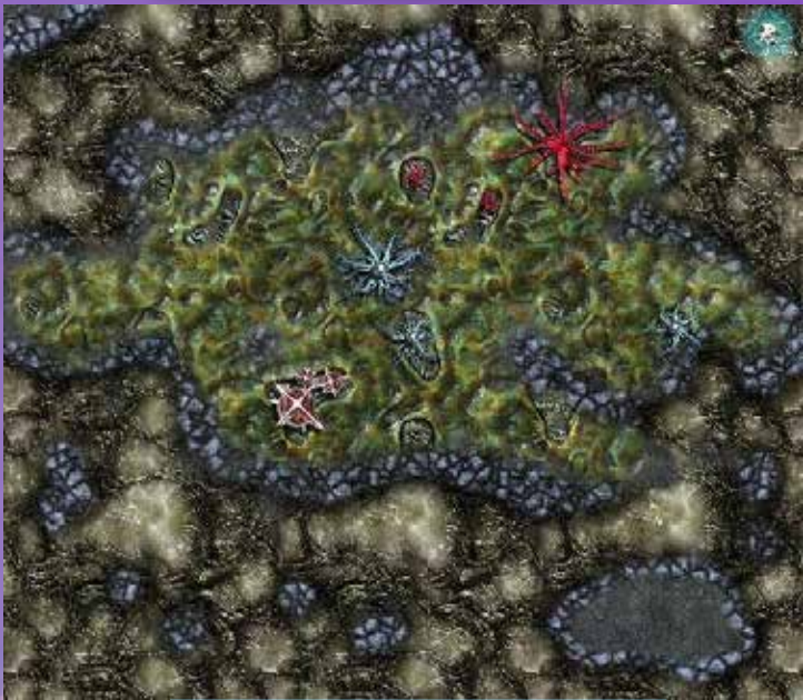
KALUUNI SWAMP ENCOUNTER MAP